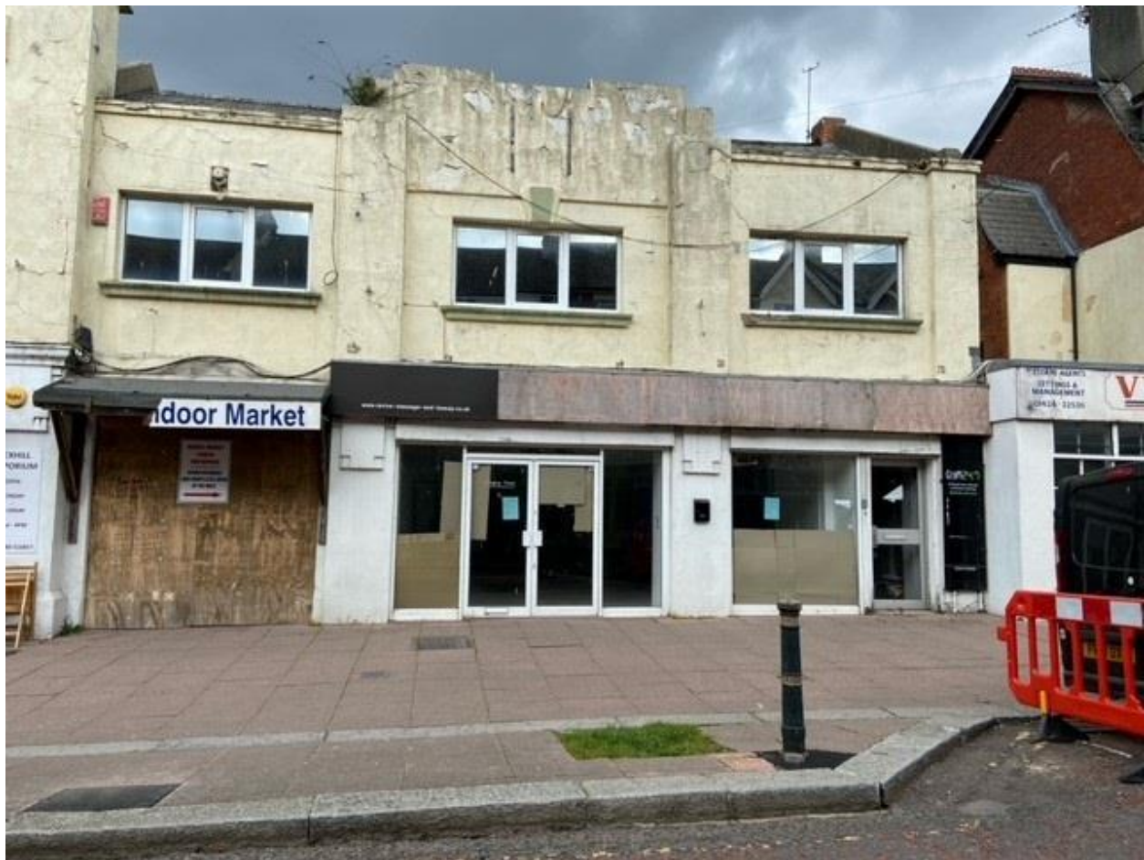
Photo of premises